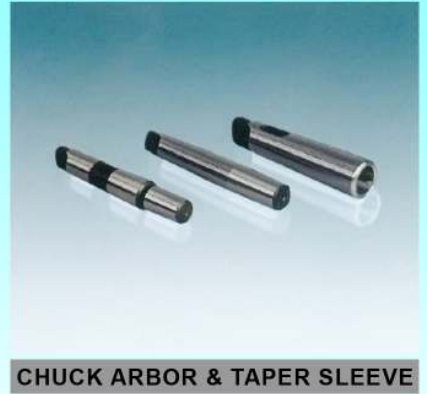
CHUCK ARBOR & TAPER SLEEVE